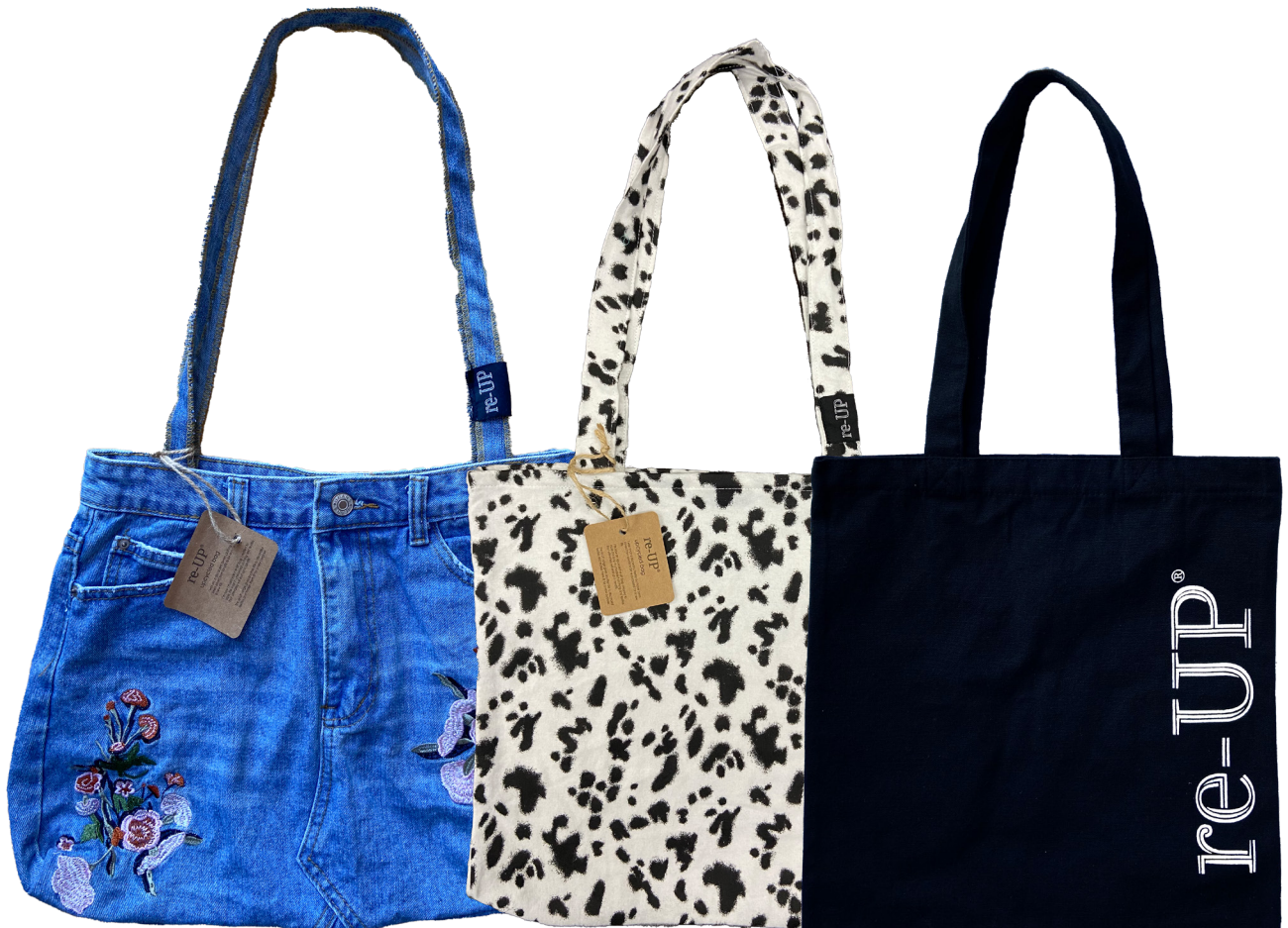
Pictured (left to right): Upcycled denim hand bag, Upcycled fabric tote, Recycled textile-to-fabric bag.

We give unwanted, discarded textiles another life and make them fit for a new purpose.