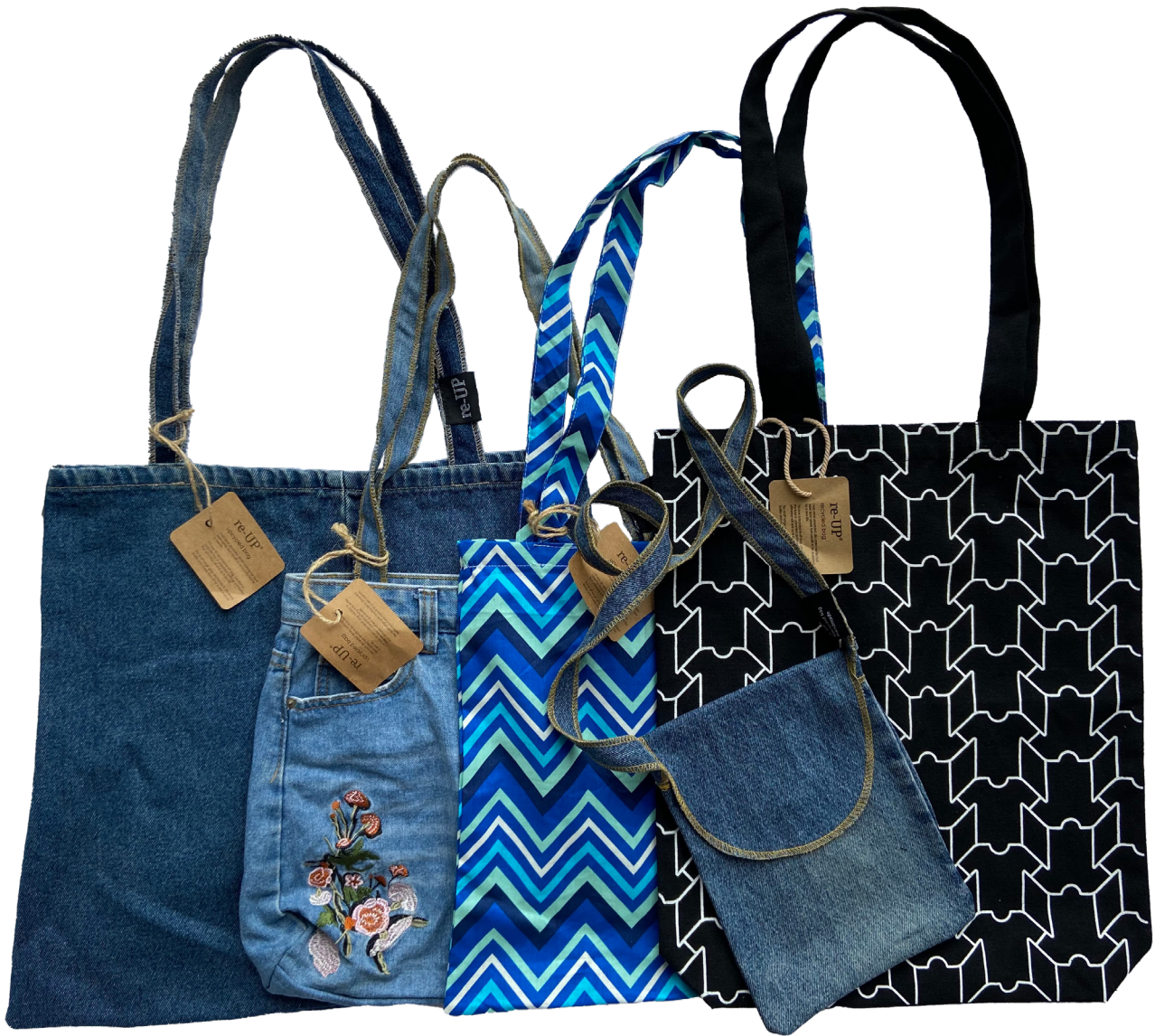
Pictured (left to right): Upcycled denim tote bag, Upcycled denim handbag, Upcycled fabric tote, Upcycled cross-body shoulder pouch, Recycled Daily Bag.